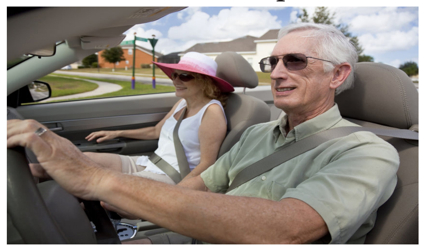
...and those that don't